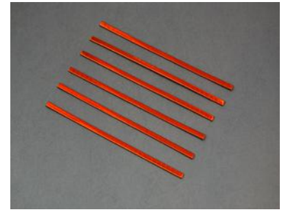
Glass covered film sintered copper wire