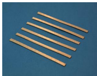
Dacron glass covered wire