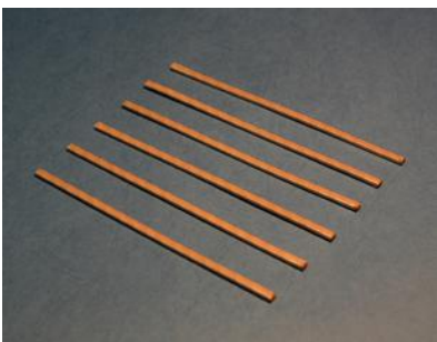
Glass covered film mica wrapped wire