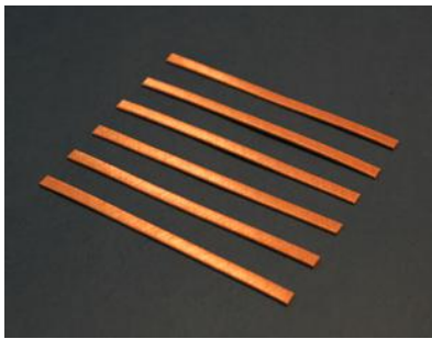
Dacron glass covered sintered electromagnetic wire